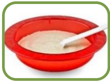
Baby cereal with iron