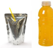
fruit drink or punch