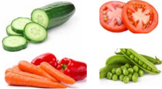
fresh or frozen vegetables