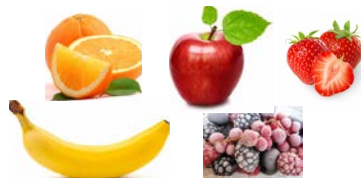
fresh or frozen fruit