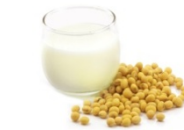
fortified plain soy beverage