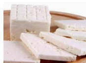
cheese or cheese string